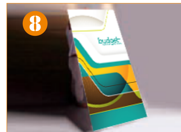
8. While positioned behind the stand tilt the unit towards you and raise the graphic to the top of the pole