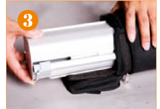
3. Remove bannerstand from bag