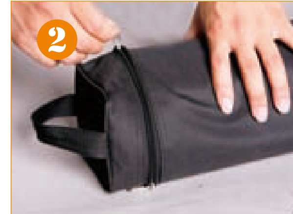
2. Unzip the bag