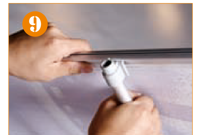
9. Attach the top bar onto the pole