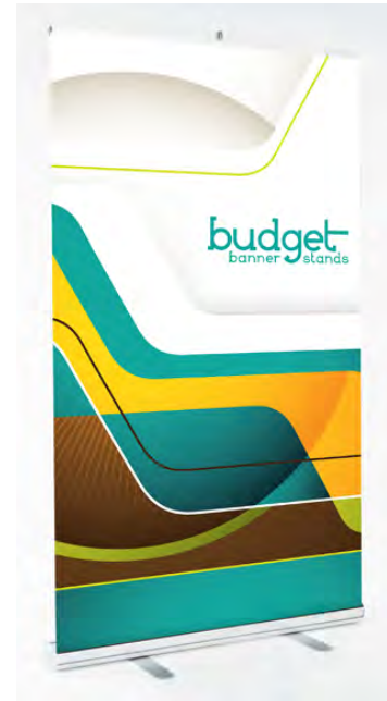
48" W Bannerstand BNR-BU2-1200HG