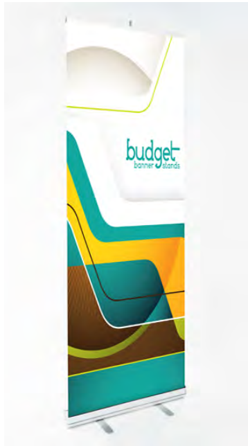
24" W Bannerstand BNR-BU2-600HG