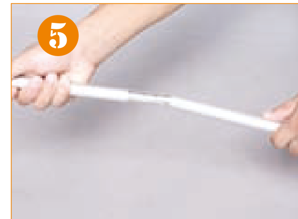
5. Extend the pole