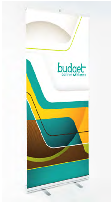
33.5" W Bannerstand BNR-BU2-850HG