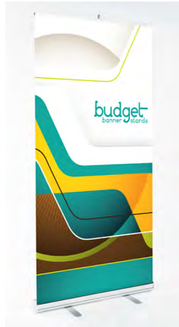
39" W Bannerstand BNR-BU2-1000HG