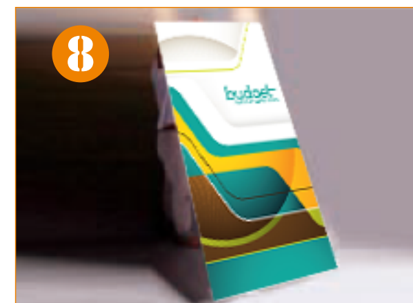
8. While positioned behind the stand tilt the unit towards you and raise the graphic to the top of the pole