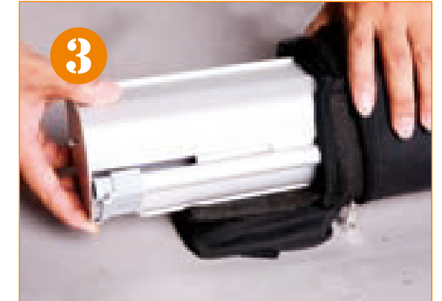
3. Remove bannerstand from bag