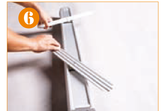
6. Twist out the feet and place the bannerstand on the floor