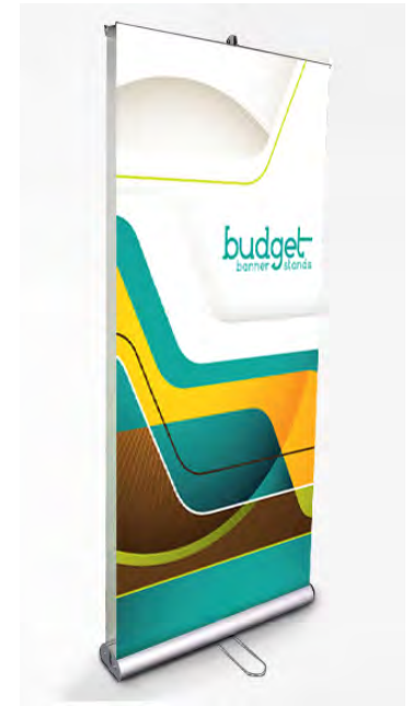
33.5" W Dual Bannerstand BNR-BUD2-850HG