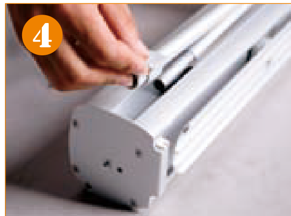
4. Remove pole from the base