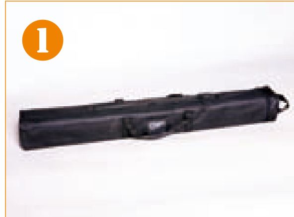
1. Place bag on the floor